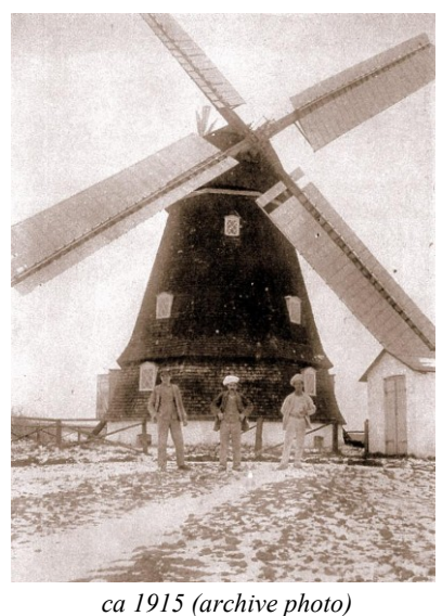
- see current news on the website