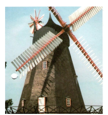
Højsagervej 8, 3480 Fredensborg

Højsager Mill, was built in 1870. It was protected in 1959 but was operating until 1972.