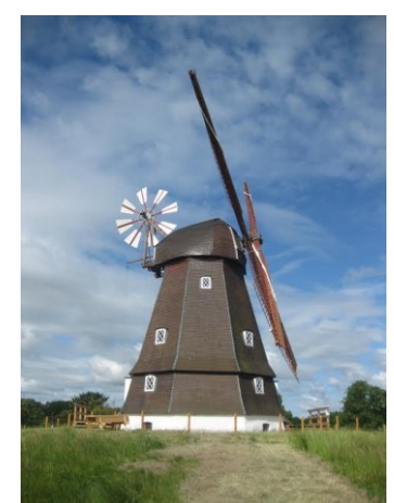
Karlebo Mill, Kirkeltevej 161C, 2980 Kokkedal

There have been various types of milling in Karlebo since the Middle Ages. The current mill is from 1835 and was built on the site of a burnt down post mill. The mill operation ceased in 1946.